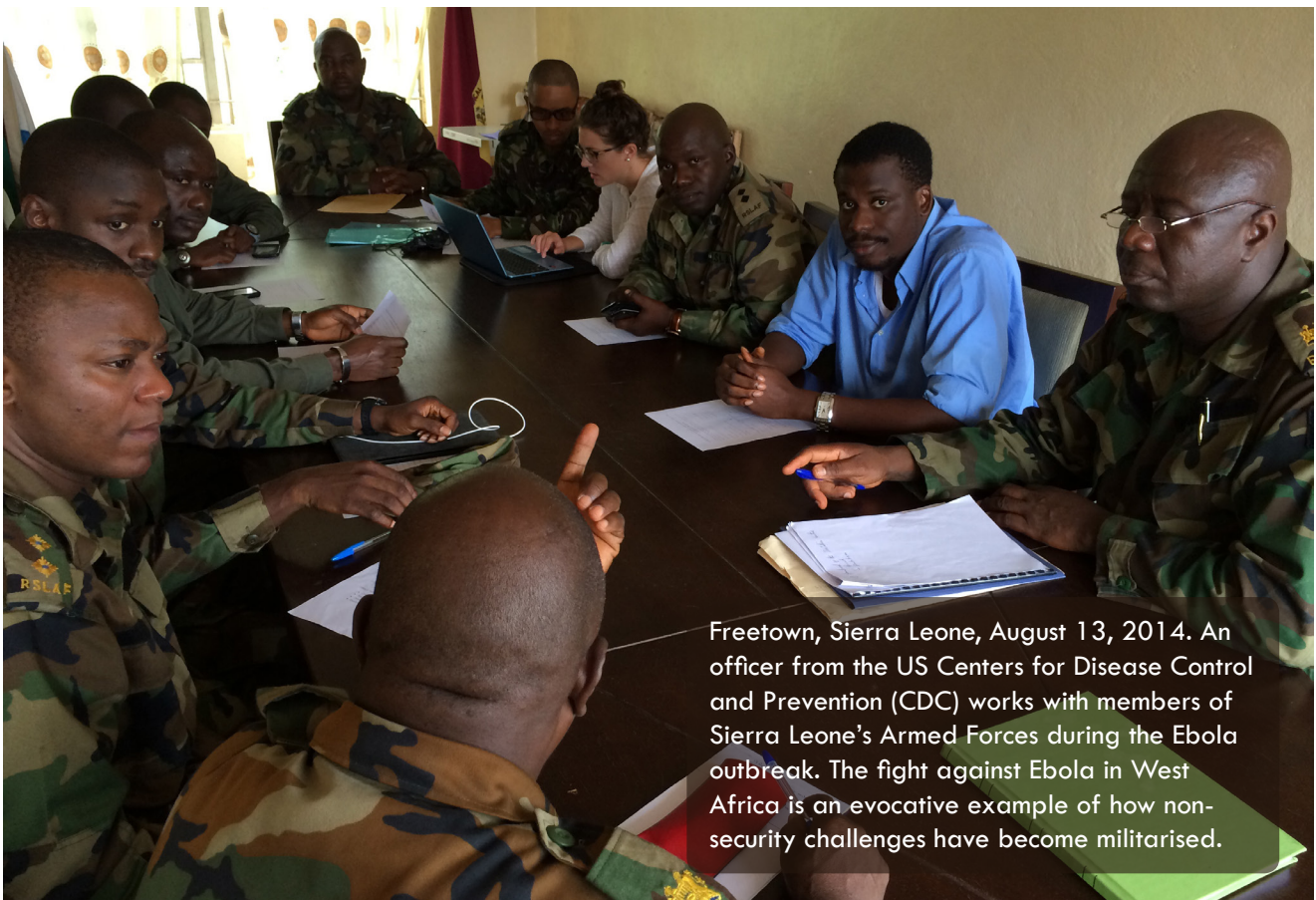
Freetown, Sierra Leone, August 13, 2014. An officer from the US Centers for Disease Control and Prevention (CDC) works with members of Sierra Leone's Armed Forces during the Ebola outbreak. The fight against Ebola in West Africa is an evocative example of how non-security challenges have become militarised.

This analysis was written within the research programme AU Waging Peace? Explaining the Militarization of the African Peace and Security Architecture, funded by the Swedish Research Council. ■